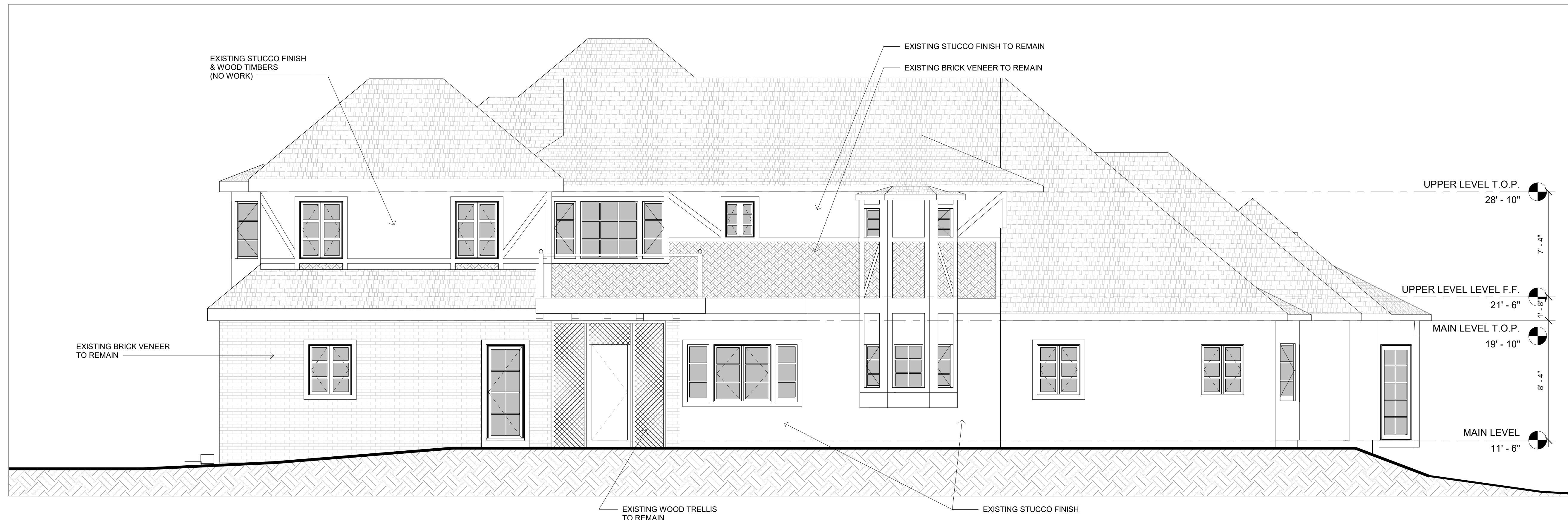
2 SOUTH ELEVATION - EXISTING 1/4" = 1'-0"